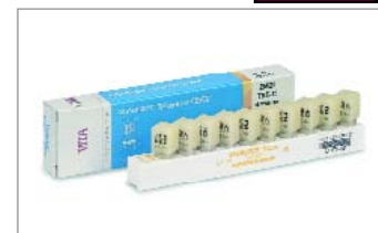
VITABLOCS® TriLuxe Forte for CEREC®