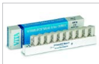
VITABLOCS® Mark II for CEREC® for the reproduction of bleached teeth