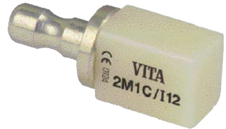
VITABLOCS® Mark II

VITA and Sirona - the perfect match. Two strong partners you can count on for the future of all-ceramic technology.